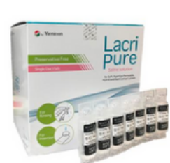
LacriPure Filling Lens Bowl