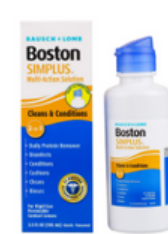
Boston Simplus Quick Cleaning