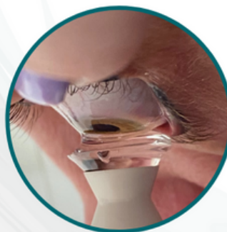
Saline touches eye first