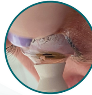
Lens seating on eye