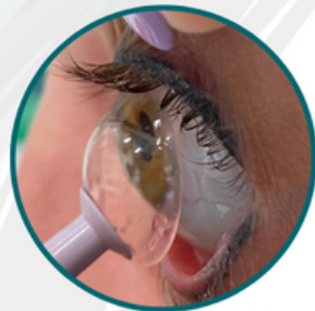
Pull Out and Up