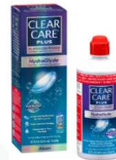
Clear Care Daily Cleaning