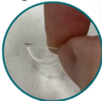
Proper Lens Handling

Once inserted, check for air bubbles in a mirror and by assessing vision. If a bubble is present, remove and try again.